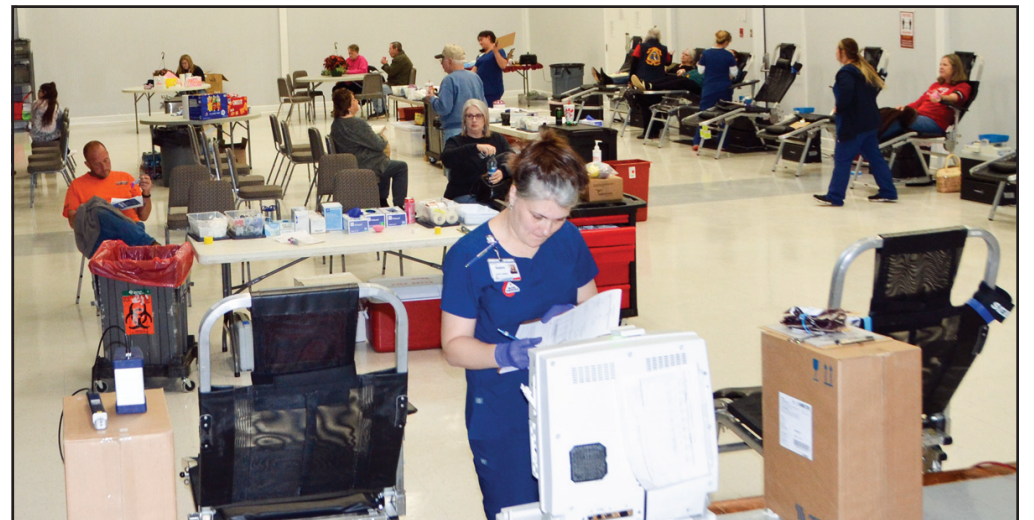
Donors turned out in force to give back by giving blood at the annual Derrick Whittle Memorial Blood Drive.