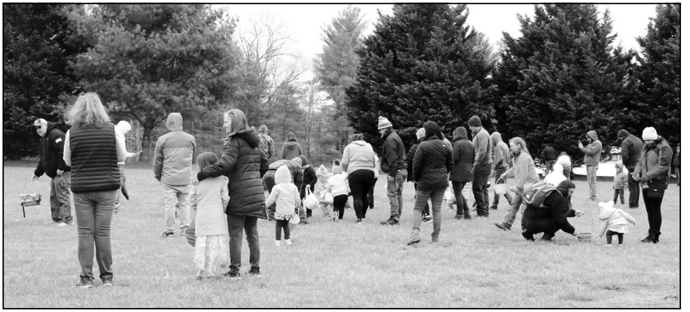
Toddlers got a helping hand from parents to pick up their eggs during the April 9 Easter Egg Hunt at Meeks Park.