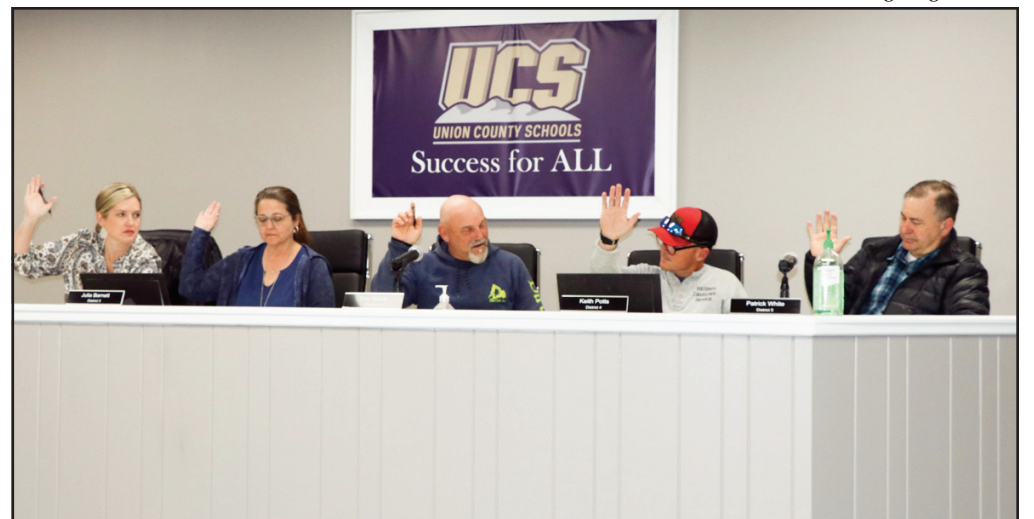
Union County Board of Education members voting in their called meeting last month.